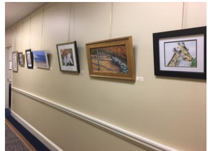
Photos from our GFAA show at the Annapolis State House